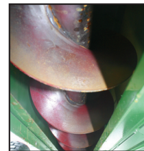
Bottom Unload / Clean-Out Doors