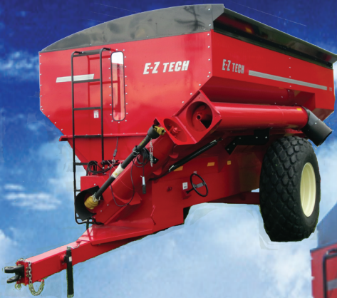
Model 744 (shown in red)